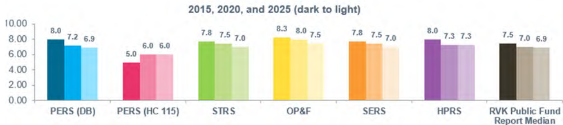
Figure 6: Historical Actuarial Rates of Return

Over the past ten years, the median actuarial rate of return for public funds within the RVK universe has declined (see Figure 6). Actuarial rates for four of the six Ohio plans are above the RVK universe median. Figure 7 shows the dispersion of actuarial rates of return around the median of 6.9%.