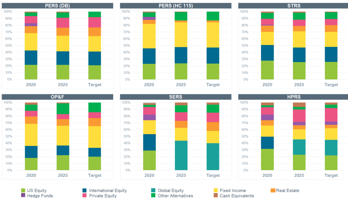
Figure 2: Asset Allocation Changes (5 Years)

STRS currently has the largest allocation to US equity at 25.5%. Zero of the six plans have a higher exposure to US equities than peer median (peer median: 27.44%). PERS (HC 115) has the largest fixed income allocation at 34.9%. The average total allocation to hedge funds, private equity, and other alternatives among the six plans is 21.3%. Relative to peer median allocations (All Public Plans > $1B), three of the six plans have higher strategic exposures to international equities (peer median: 15.9%) Four of six plans have higher allocations to real estate than peer median (peer median: 7.2%).