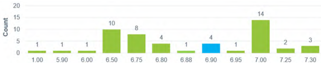
Figure 7: RVK Public Fund Report Survey Actuarial Rates of Return – As of 6/30/2025

RVK prepares a proprietary Public Fund Report with over 70 participating public funds across the U.S. Participating public funds are surveyed semi-annually. This data is preliminary for 6/30/2025 and is subject to change.