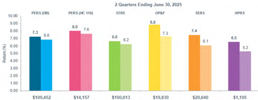
Figure 1: Total Fund Performance (dark shade) vs. Total Fund Benchmarks (light shade)

During the first half of 2025, all six plans outperformed or kept pace with their custom total fund benchmarks. Each plan will have different investment objectives and goals and the “Total Fund Benchmarks” will reflect this. Total Fund over/under performance can come from differences in actual allocations or investment manager results.