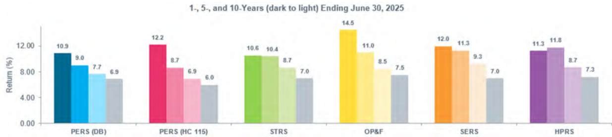
Figure 5: Fund Performance (Gross) vs. Actuarial Rate of Return (Gray)

2 PERS (DB): 5 Year performance reduced 0.23%, 7 Year performance reduced 0.16%, & 10 Year performance reduced 0.11% due to change in distribution methodology in private equity and real estate portfolios.