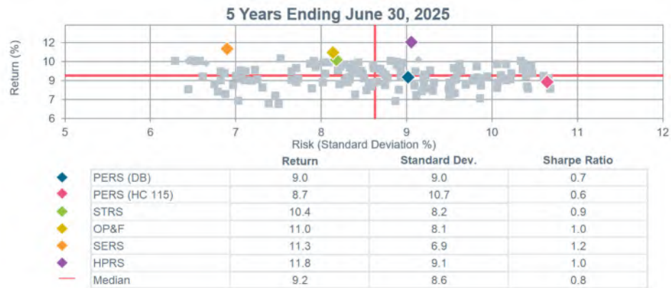
Figure 10: All Public Plans > $1B Risk and Return

5 Grey boxes on scatterplot charts represent members of the peer universe.