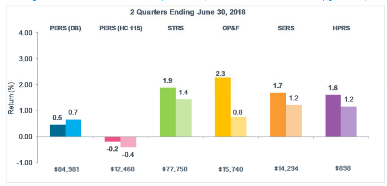
Figure 1: Total Fund Performance (dark shade) vs. Total Fund Benchmarks (light shade)

During the first half of 2018 calendar year, five out of six plans outperformed their custom total fund benchmarks. Each plan will have different investment objectives and goals and the "Total Fund Benchmarks" will reflect this. Total Fund over/under performance can come from differences in actual allocations or investment manager results.