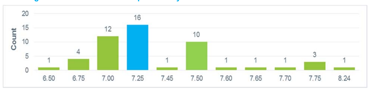
Figure 7: RVK Public Fund Report Survey Actuarial Rates of Return – As of 06/30/2018

Over the past ten years, the median actuarial rate of return for public funds within the RVK universe has declined (see Figure 6). Actuarial rates for five of the six Ohio plans are above the RVK universe median. Figure 7 shows the dispersion of actuarial rates of return around the median of 7.25%.