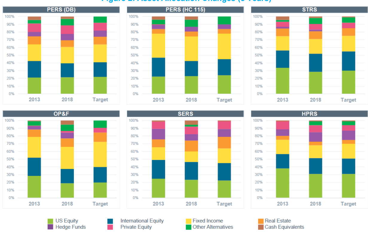
Figure 2: Asset Allocation Changes (5 Years)

HPRS currently has the largest allocation to US equity at 31% while OP&F has the smallest domestic equity allocation at 19%. PERS (HC 115) has the largest fixed income allocation at 32%. The average total allocation to hedge funds, private equity, and other alternatives among the six plans is 21%. Relative to peer median allocations (All Public Plans > $1B), two of six plans have higher strategic exposures to international equities (peer median: 20.9%) and four of six plans have lower strategic exposures to US equities (peer median: 28.4%). Five of six plans have higher allocations to real estate (peer median: 6.3%).