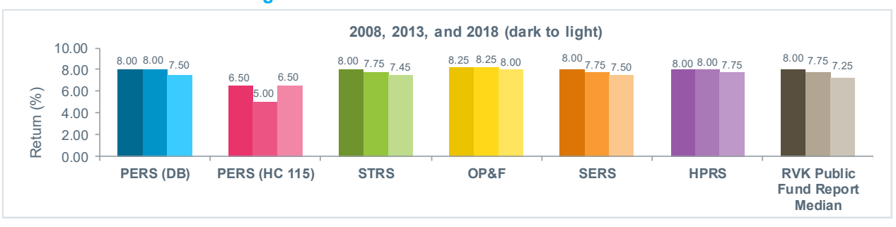
Figure 6: Historical Actuarial Rates of Return

Over the trailing 10-year period, all six plans have underperformed their current actuarial assumed rate of return as shown by Figure 5.